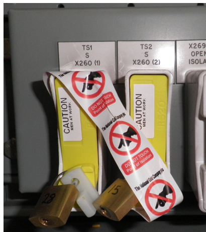
Figure 4.1 – Example of Protection Multiple “S” Link Isolation

Reference shall be made to protection drawings to determine Point(s) of Isolation .