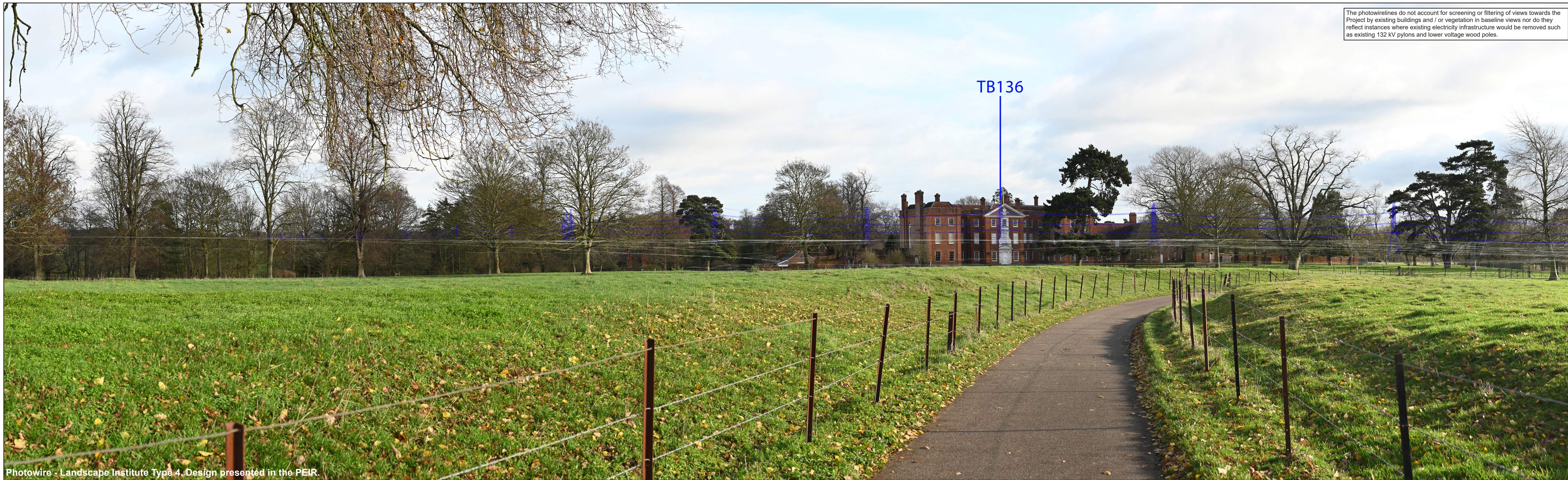
Photowire - Landscape Institute Type 4. Design presented in the PEIR.

The photowirelines do not account for screening or filtering of views towards the Project by existing buildings and / or vegetation in baseline views nor do they reflect instances where existing electricity infrastructure would be removed such as existing 132 kV pylons and lower voltage wood poles.