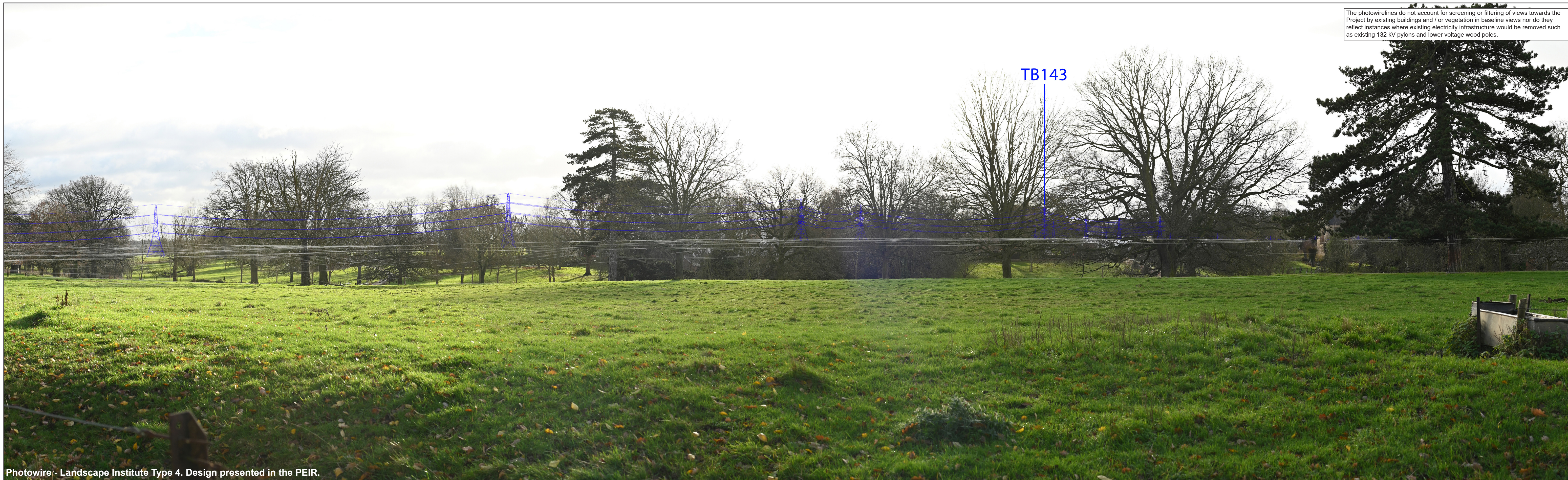
Photowire/- Landscape Institute Type 4. Design presented in the PEIR.

The photowirelines do not account for screening or filtering of views towards the Project by existing buildings and / or vegetation in baseline views nor do they reflect instances where existing electricity infrastructure would be removed such as existing 132 kV pylons and lower voltage wood poles.