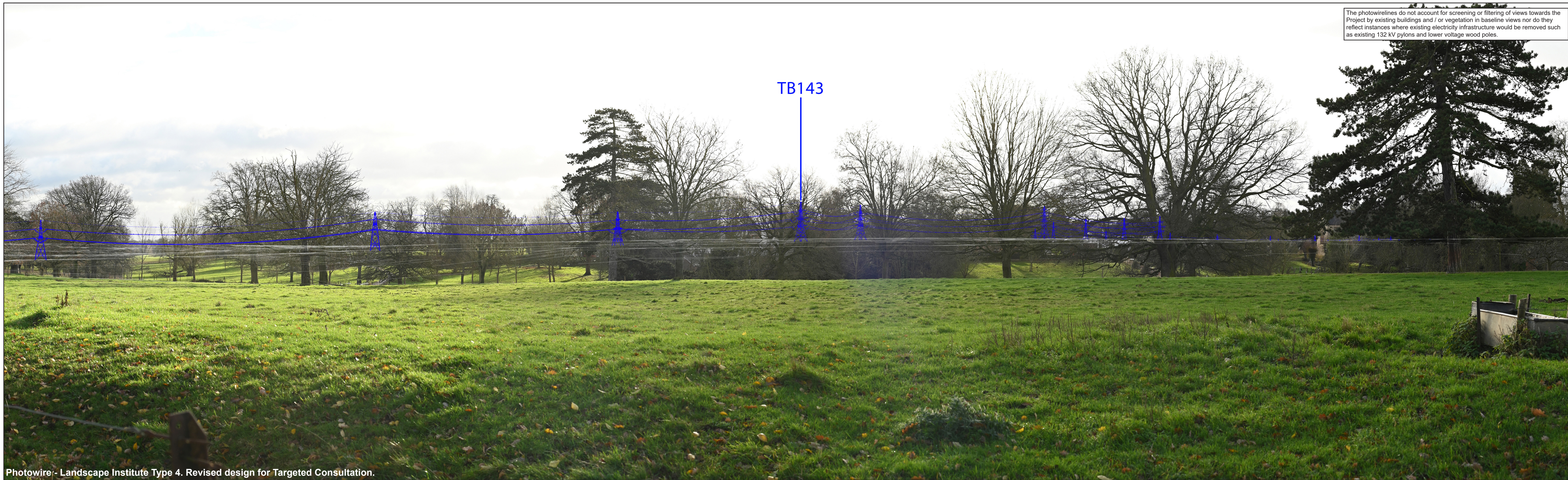
Photowire/- Landscape Institute Type 4. Revised design for Targeted Consultation.

The photowirelines do not account for screening or filtering of views towards the Project by existing buildings and / or vegetation in baseline views nor do they reflect instances where existing electricity infrastructure would be removed such as existing 132 kV pylons and lower voltage wood poles.