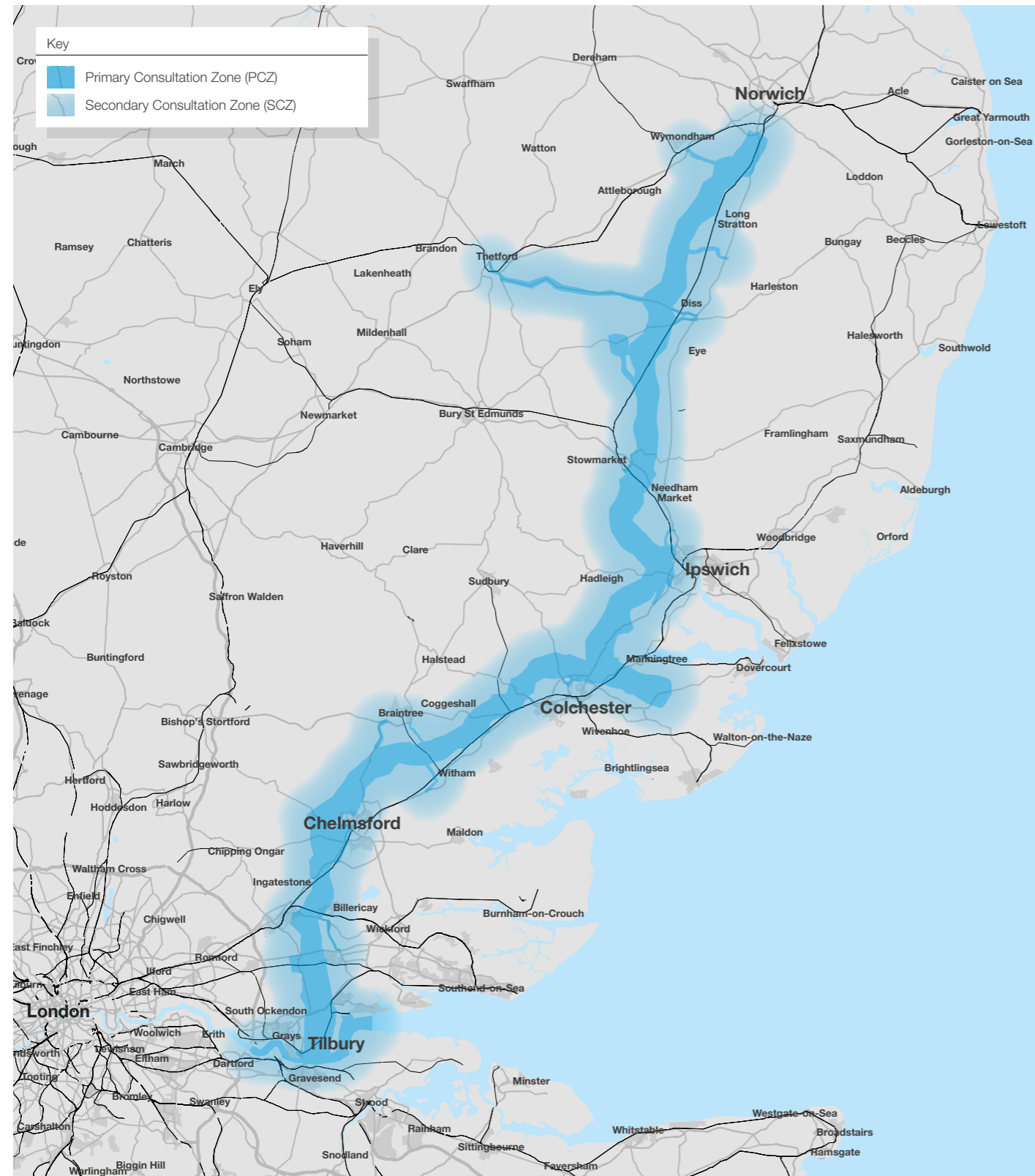
Appendix A – Primary and Secondary Consultation Zones