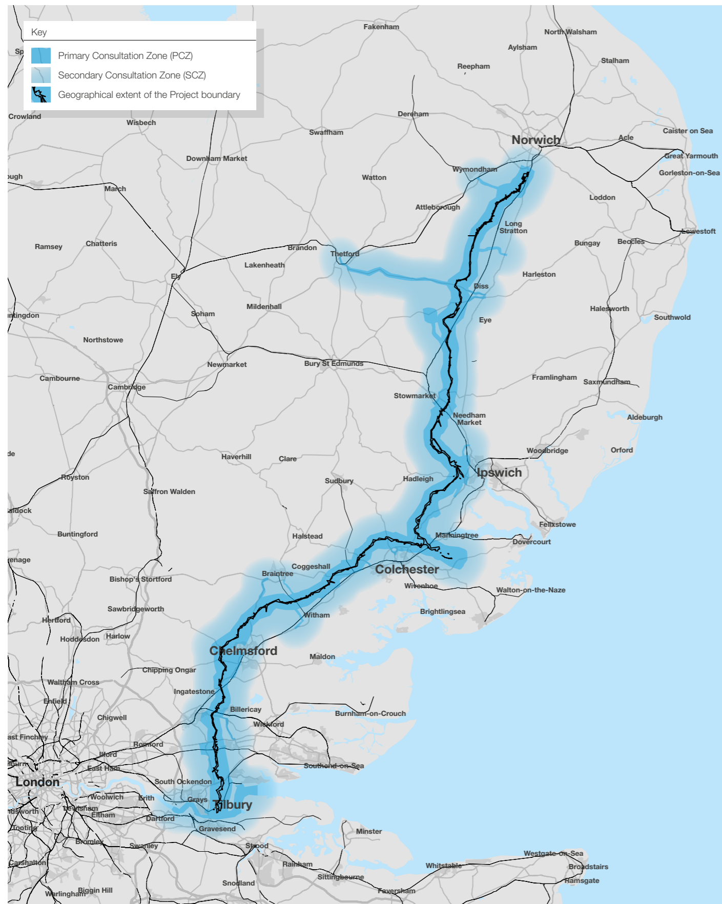
Figure 5.1: Map of Project area