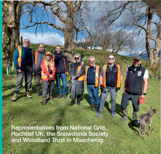
Representatives from National Grid, Hochtief UK, the Snowdonia Society and Woodland Trust in Maentwrog.

After a rewarding and productive session, the intrepid sleeve removers were treated to a site visit through the woods and up to the farmhouse which is in the process of being renovated to become a volunteer hub.