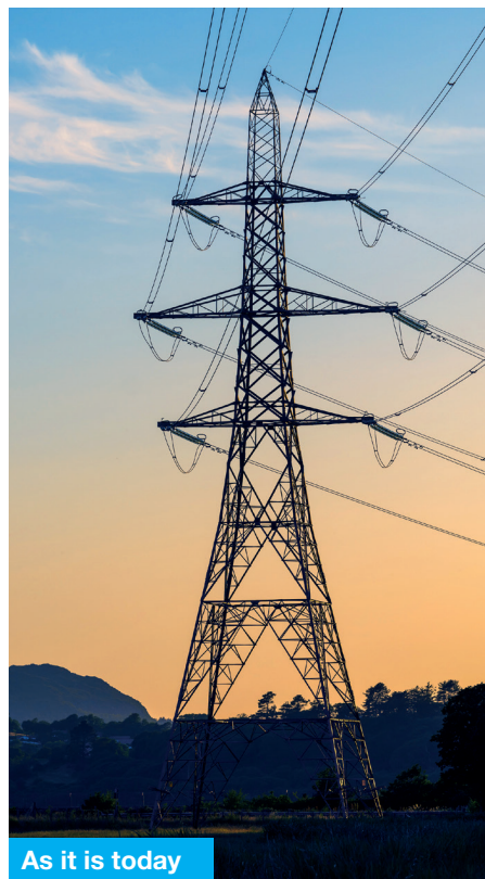
As it is today

Over the autumn term, we will be heading to schools around the local area, with exciting opportunities for youngsters to take part in workshops based on science, technology, engineering and maths (STEM). They will also be given the important task of suggesting a name for the TBM – more about that inside.