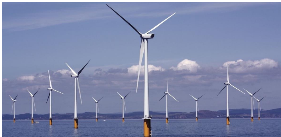
1 One of the increasing numbers of offshore wind farms being built as we move to a renewable based power system.

In 2013, at the start of the regulatory price control period RIIO T1, it was recognised that there was a need to accelerate generation connections ahead of network reinforcement if climate targets were to be achieved using a process called Connect and Manage. It was also recognised that when necessary network reinforcement outages were later required, this could cause increased system constraint costs. It would also restrict system access for those connected ahead of reinforcement as well as existing customers. It was these issues that determined the need for a Network Access Policy (NAP).