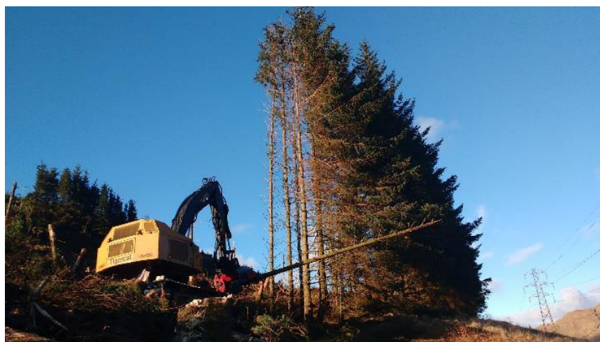
2 - Live overhead line techniques using Tigercat to remove trees that would otherwise require an outage due to the proximity of the transmission circuit to the right.

We commit to enhanced stakeholder engagement therefore the TOs will continuously review our long-term outage plans to identify, in conjunction with the ESO, any outage that is greater than 4 weeks and communicate this during this planning timeframe to the relevant stakeholder. The TOs will commit to working with NGESO and the relevant stakeholder to identify solutions to minimise the impact of long duration outages.