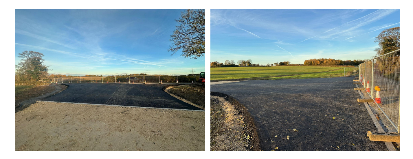
Image caption: Photographs of a bellmouth that has been constructed at Monk Fryston.