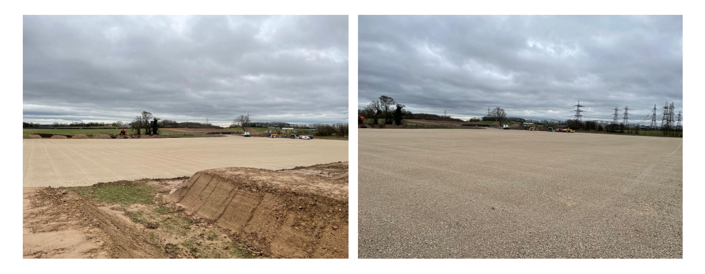
Image caption: Photographs of the stone compound site at Monk Fryston. This area will be used to house our welfare cabins, main site offices and storage of materials and equipment during construction.

To keep members of the public and our teams safe while carrying out our preparatory activities, we have installed temporary traffic management measures near to our sites.